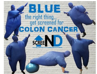
ScreeND Team Quality Health Associates of North Dakota