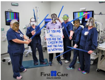
First Care Health Center GI Team

Thank you to every team who submitted a photo for the Turn ND Blue contest! Congratulations to the winner of the Hospital Category: First Care Health Center's GI Department . The QHA ScreeND Team won the category for Community & Education Group/Non-Medical Worksites.